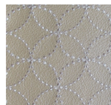
Avignon Pearl Shell