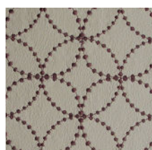
Anney Cottage Wall