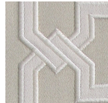
Cream on Wheat