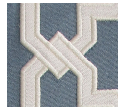
Cream on Steel Blue