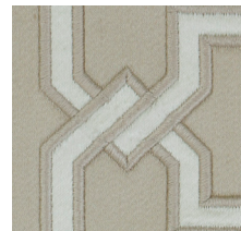
Cream on Dune